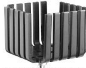
Representative Photo Only